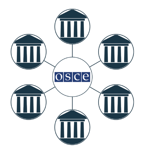
Figure 2. Graphic representation of a potential OSCE permissioned DLT system for CAC

A permissioned blockchain would provide higher degrees of confidentiality by encrypting information and authorising only certain nodes as validation mechanisms.