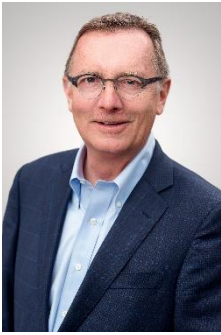
Mr Jeffrey Feltman